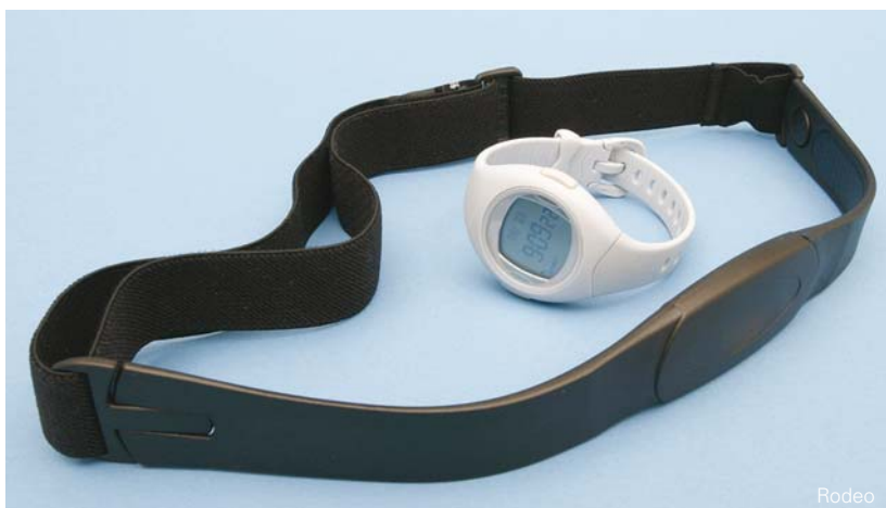
For example, the belt of a pulse counter sends the pulse rate to the display device held on the wrist using a low-power radio transmitter.

The detectors attached to products send very low-power radio waves or none at all. The exposure caused by the receiving devices is only momentary. For example, a customer who walks through a production protection gate post based on the RFID technique is exposed to radio waves for less than a second when leaving the shop.