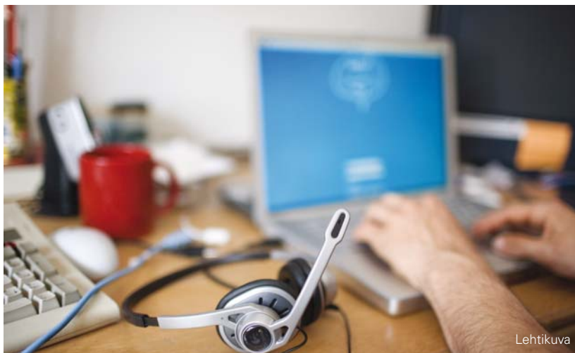
A PC equipped with a WLAN is best kept on the table rather than in the lap.