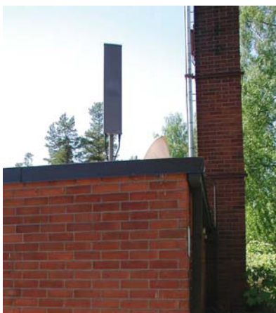
It is not recommended to go to the immediate vicinity of base station antennas.

When surfing the internet, most of the data transmission is directed from the base station to the ter-